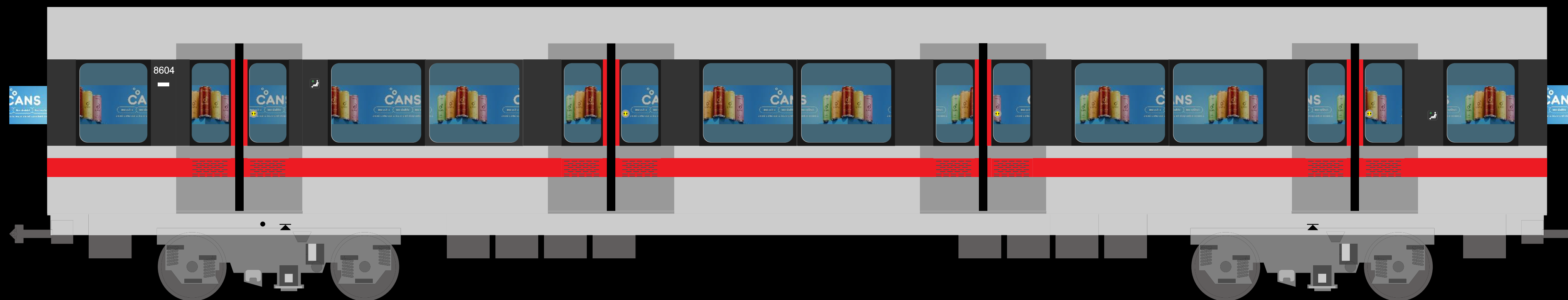
Approximate example of the display in the third carriage of the train set